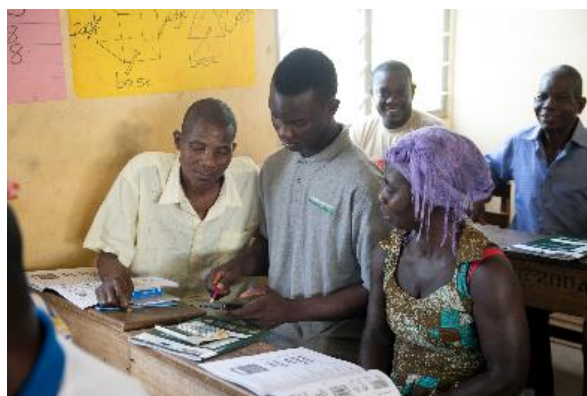
Use of calculator