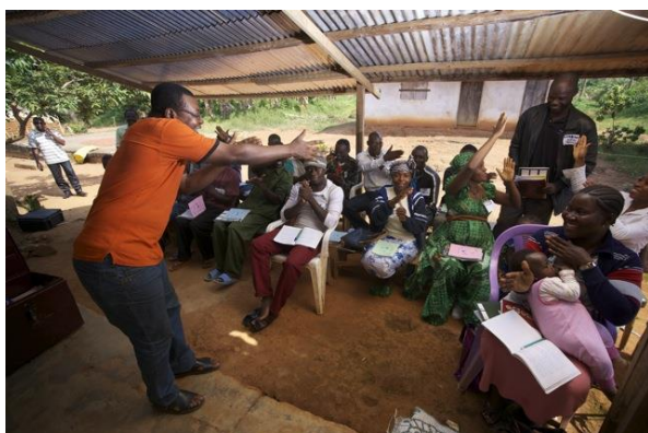
FBS in action Enthusiasm

Over 480,000 cocoa producers (29% women) in Côte d'Ivoire, Ghana, Cameroon, Nigeria, and Togo participated in FBS trainings under Sustainable Smallholder Agri-Business (SSAB), ABF's precursor project. Since 2012, 40 other development programs, their partners, national organizations and 2 companies adapted FBS with support from SSAB for 39 value chains other than cocoa. In total, more than 1,625,000 smallholders (33% women) in 25 African countries have undergone FBS training.